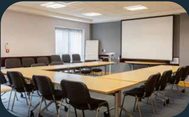
Conference facilities at LEO