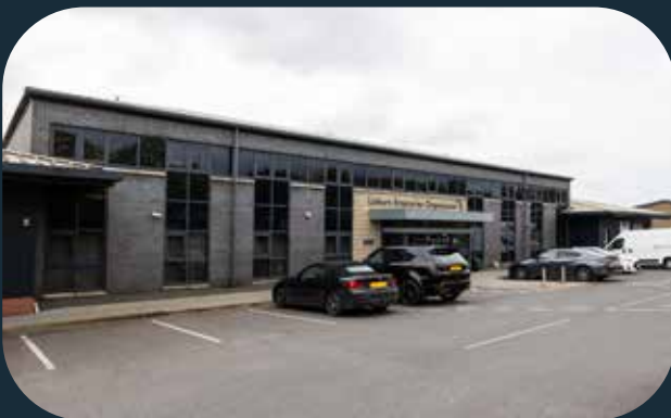
LEO Main Building