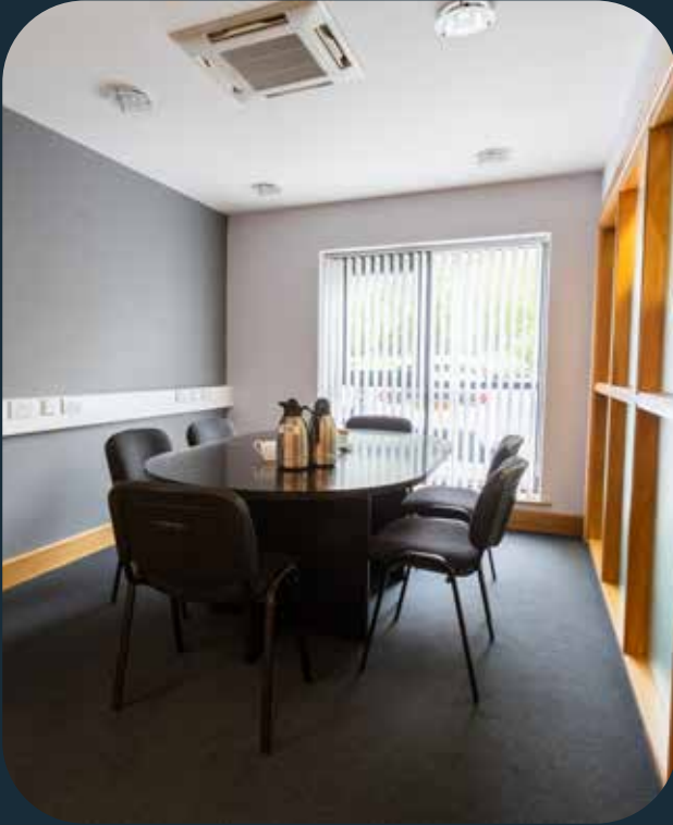
LEO Meeting Room

In 2025, these two funds collectively committed £340,000 in financial support to 27 businesses and entrepreneurs based in Lisburn.