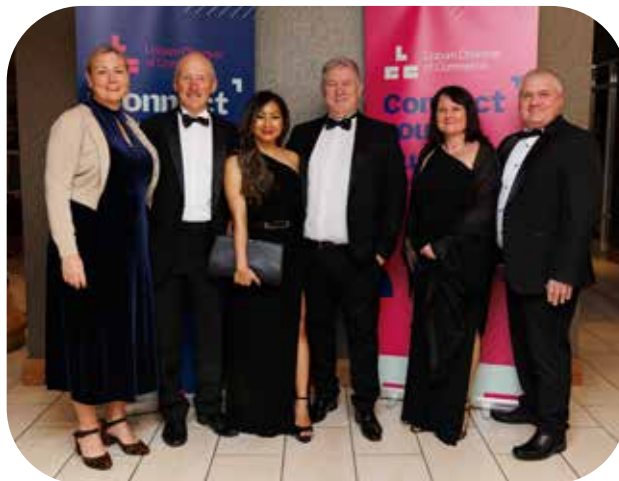
Directors and Staff at Lisburn Chamber of Commerce Annual Dinner

LEO also continues to engage constructively with the Bank of England and the British Business Bank, ensuring that the experiences and perspectives of Lisburn businesses are represented in the economic and financial intelligence gathered by Bank agents.