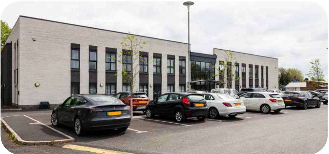
LEO Phase 7 Office Building

LEO remains dedicated to environmental sustainability; this year, our integrated waste management and recycling programmes successfully diverted 86 tonnes of material from landfill.