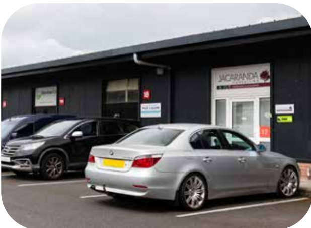
LEO Workspace Units